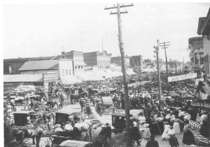
Main Street 1896

http://www.facebook.com/CedarFallsHistory