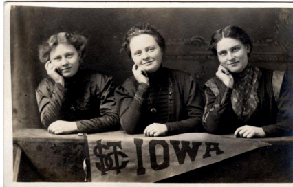
Iowa Teachers College 1909