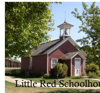
Little Red Schoolhouse

With five historic museum buildings, the Historical Society is always in need of assistance with light cleaning, dusting, weeding, planting, watering, and more.